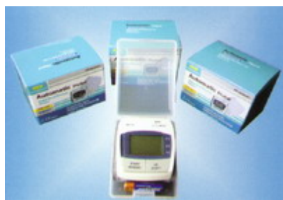
Plastic case color box