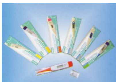
Plastic case color box