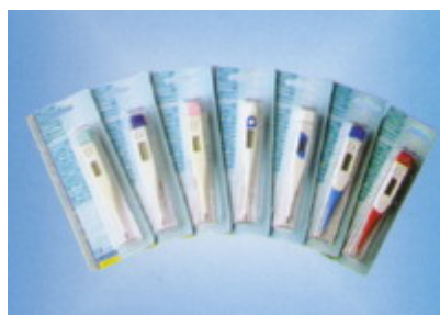
Plastic case blister card